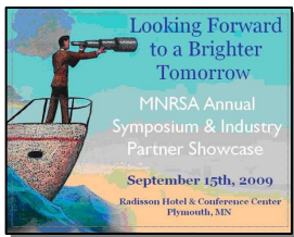
Annual Symposium & Industry Partner Showcase