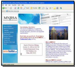
MNRSA Website (Members Only Section)