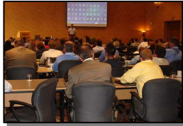
Educational Programs & Events

"Knowledge is power. Information is liberating. Education is the premise of progress."